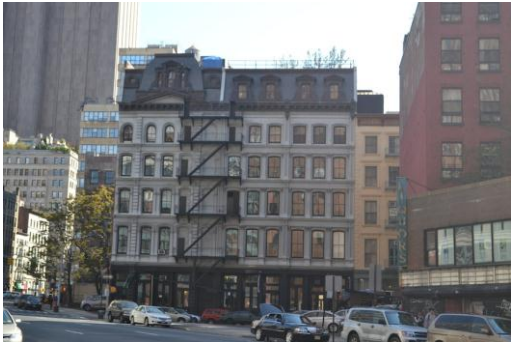
17 White St.