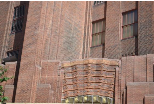
60 Hudson (detail)