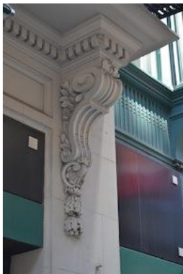
9 Murray St. (detail)