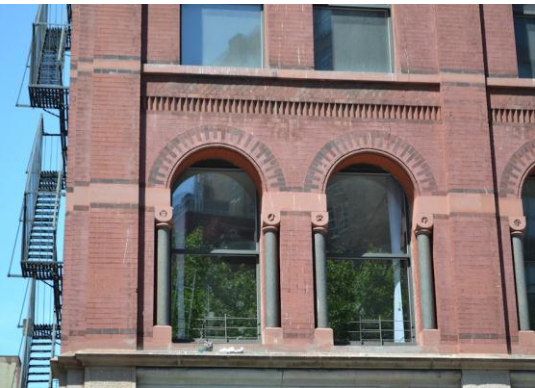
165 Duane (detail)