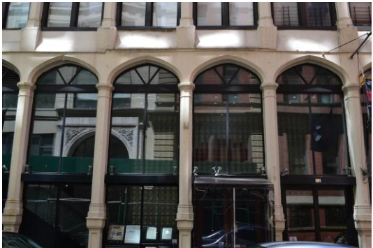
62 Thomas St.