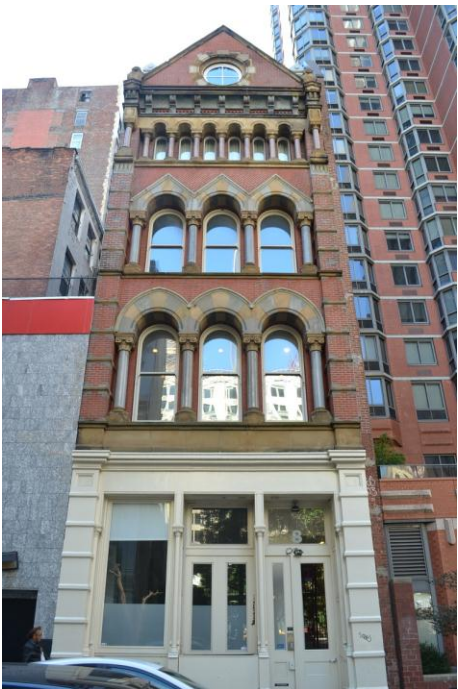
8 Thomas St.