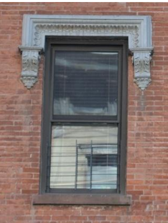
190 Duane St. (detail)