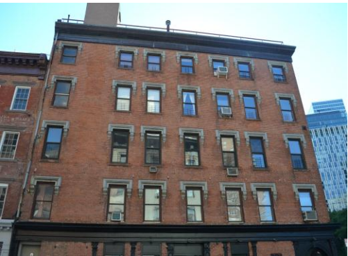
190 Duane St.