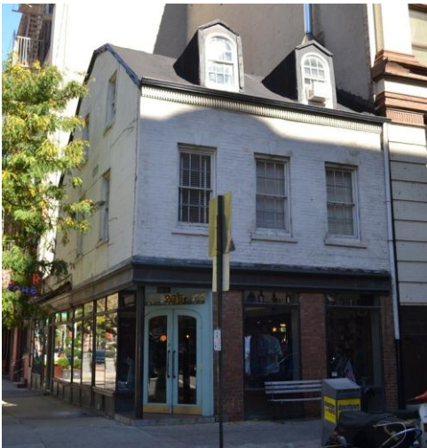
2 White St.