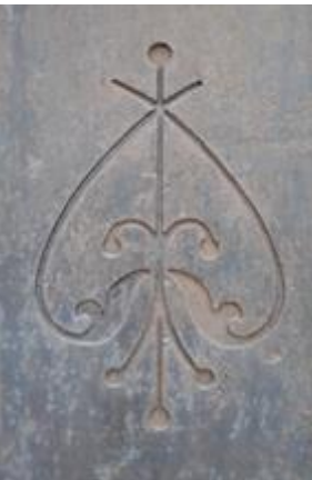
15 Harrison (detail)