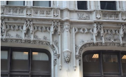
Woolworth Building (detail)