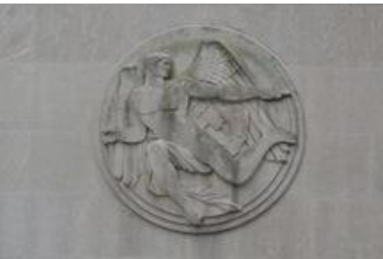
Post Office (detail)