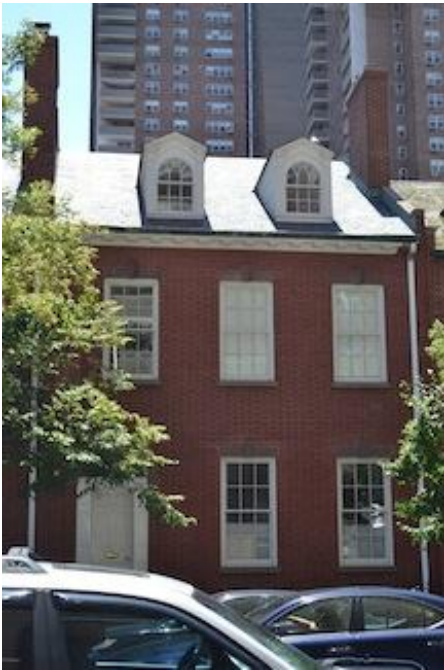
20 Harrison St.