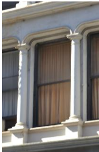
385 Broadway (detail)