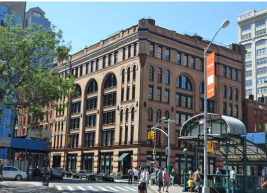
1-9 Varick St.