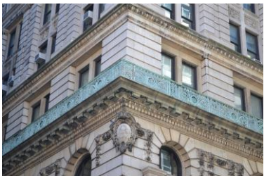
346 Broadway (detail)